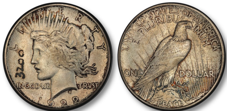
▲ A 1922 MODIFIED HIGH-RELIEF Peace dollar carries the number “3200” on its obverse. U.S. Mint Engraver Charles Morgan and sculptor James Earle Fraser agreed that the eagle’s relief should be lowered. Not Actual Size