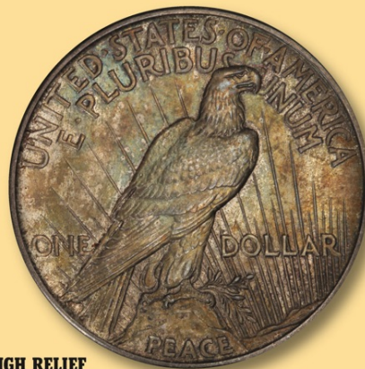
MODIFIED HIGH RELIEF