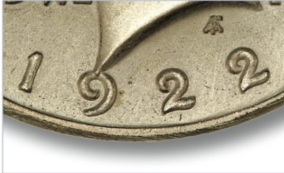
▲ ON THE SPECIMEN AT THE LEFT, the date was moved closer to the rim and the portrait was lowered in the field, as compared to the date on the Peace dollar at the right.